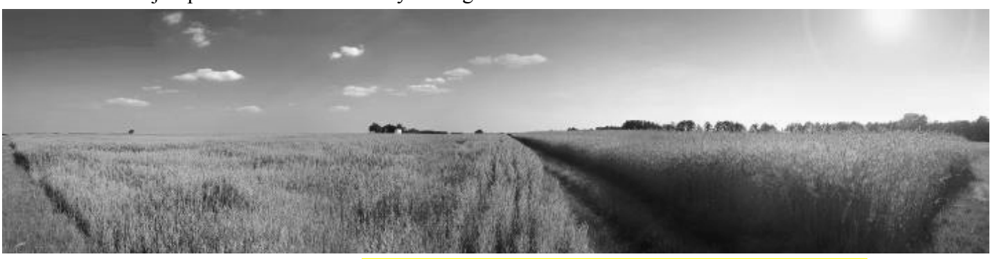
Figure 3. Large figure example [SECTION BREAK INSERTED HERE AFTER LARGE FIGURE]

The quick, brown fox jumps over the lazy dog. The quick, brown fox jumps over the lazy dog. The quick, brown fox jumps over the lazy dog (_NTR_Body_Text). The quick, brown fox jumps over the lazy dog. The quick, brown fox jumps over the lazy dog. The quick, brown fox jumps over the lazy dog ( NTR Body Text).