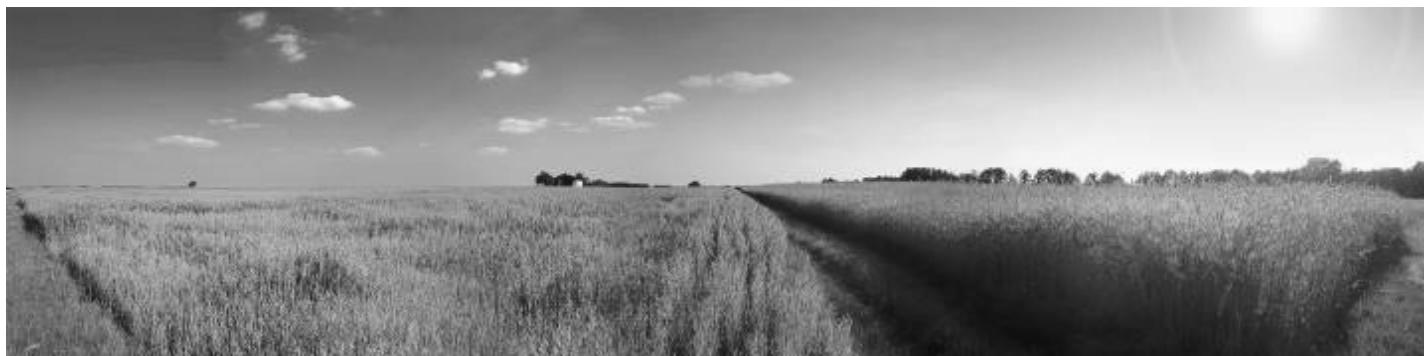
Figure 3. Large figure example [SECTION BREAK INSERTED HERE AFTER LARGE FIGURE]

(_NTR_Body_Text). [SECTION BREAK INSERTED HERE BEFORE LARGE PICTURE]